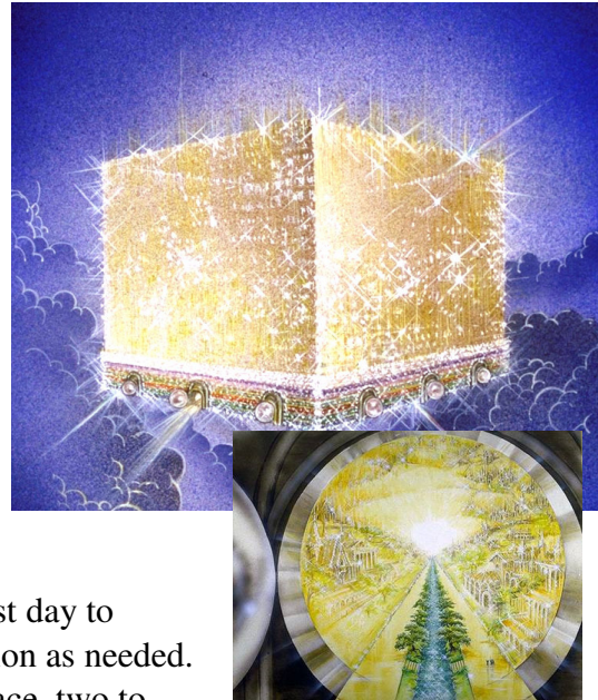
Figure 2: The Holy City and One Gate to the City by Pat Marvenko Smith. Use by Permission

The cherubim angels were created that first day. Their appearance is unlike anything found in the natural world. These creatures seem to have faces of multiple animals. These creatures guard the throne of God. Because their faces watch in all directions at the same time, they are able to fly without pivoting. Four living creatures are in front of the throne. Each has the face of a lion, bull, eagle and man. They have four wings and human-like hands under those wings. Their feet look like calves feet and they glow like polished bronze. 14