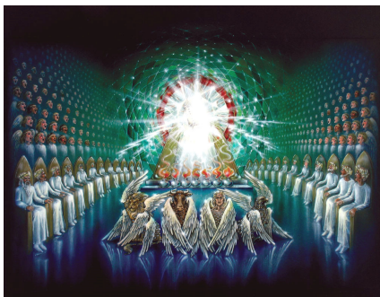
Figure 3: The Throne Room of God by Pat Marvenko Smith. Use by Permission

The throne of God looks like it is made of lapis lazuli (a beautiful blue crystal gemstone found in modern day Afghanistan) and a rainbow surrounds it. The throne has wheels with wheels in the middle of the wheels, full of eyes around all the rims and the wheels can move in all directions without turning. 15